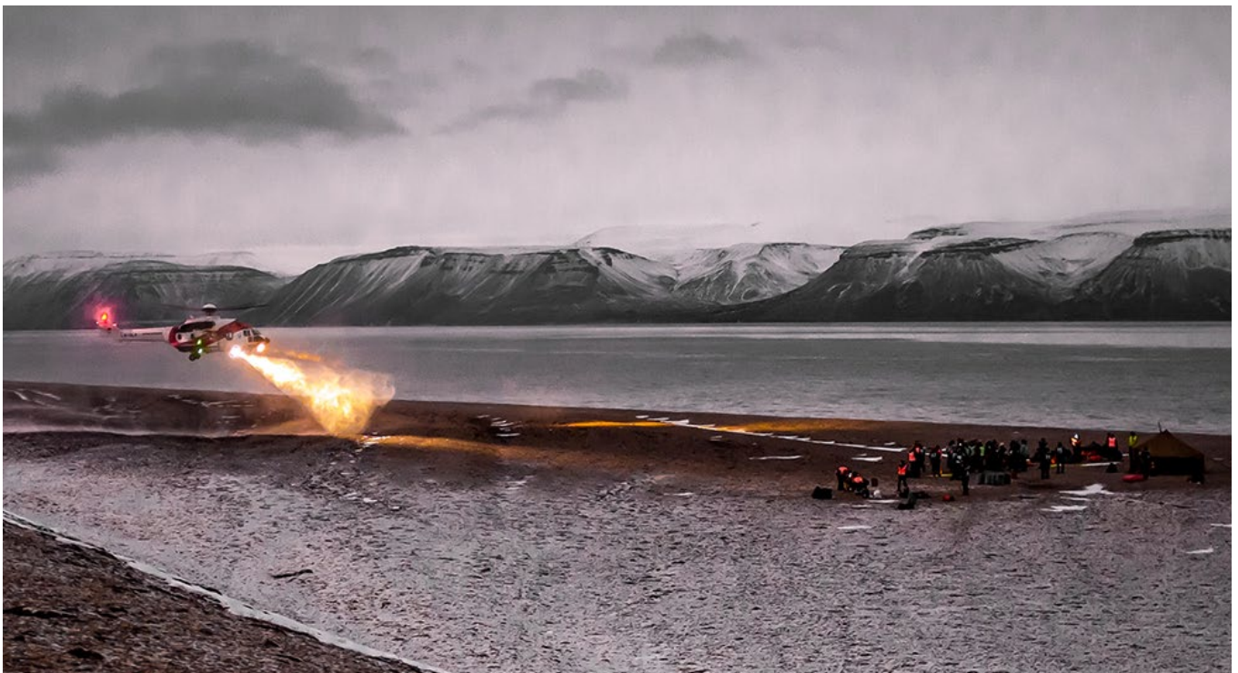
From Emergency Exercise Svalbard, 4–5 November 2014.