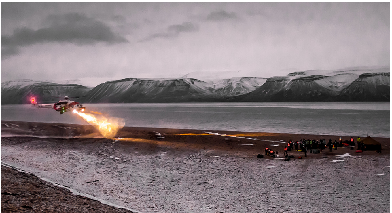
From Emergency Exercise Svalbard, 4–5 November 2014.