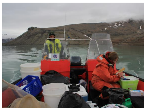
Monthly sampling from UNIS small boats will be conducted.