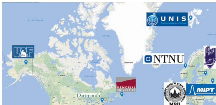
Fig. 27.1 SITRA map. Project participants (from west to east): University of Alaska Fairbanks (Fairbanks, US), Dartmouth College (Hannover, US), Memorial University of Newfoundland (St. Johns, Canada), Norwegian University of Science and Technology (Trondheim, Norway), The University Centre in Svalbard (Longyearbyen, Norway), State Marine Technical University of Saint-Petersburg (Russia), Moscow Institute of Physics and Technology (Russia), Lomonosov Moscow State University (Russia)